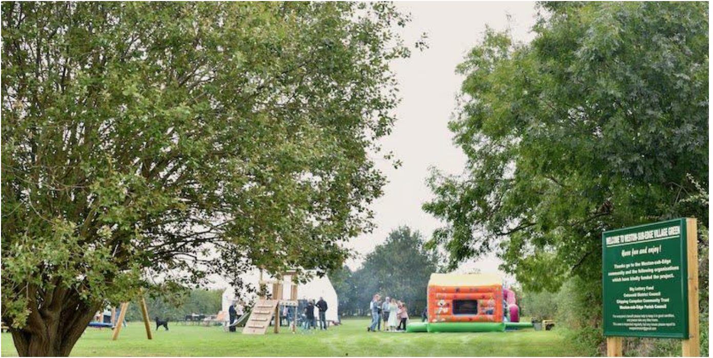
The Village Green and children's play area off Church Street.