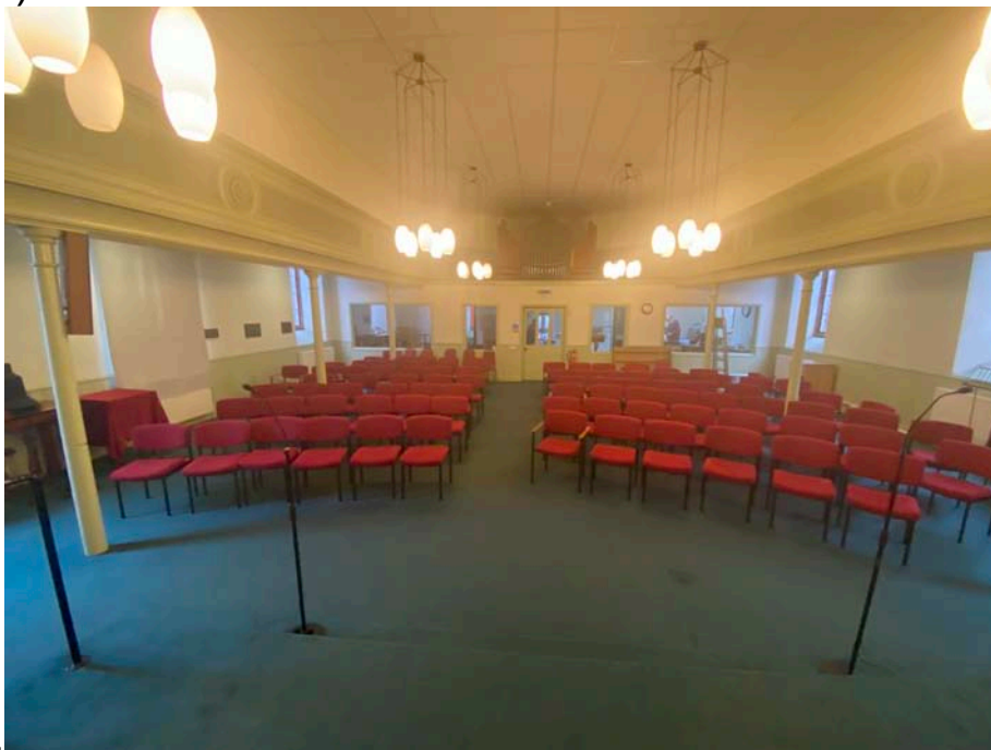
Auditorium from dais

This area has a raised dais with a lectern that may be used for religious services, lectures, and video presentations. It can accommodate up to 120 seated guests. It has excellent acoustics and would be well suited to musical events. The seats are removable and therefore suitable for non-seated events such as fetes, displays and craft fairs.