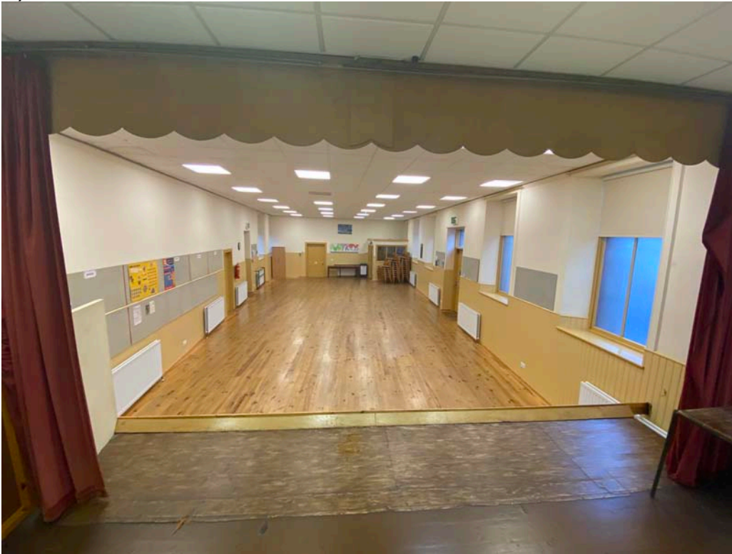
View of the Hall from the stage

The hall lies at the back of the premises and has a separate entrance from Middle Street. It has a wooden floor and is ideally suited for use with youth groups, fitness classes, dance groups or coffee mornings. There is a stage at one end and with seating installed could hold an audience of 100 for theatrical purposes. It also has an induction loop for the deaf.