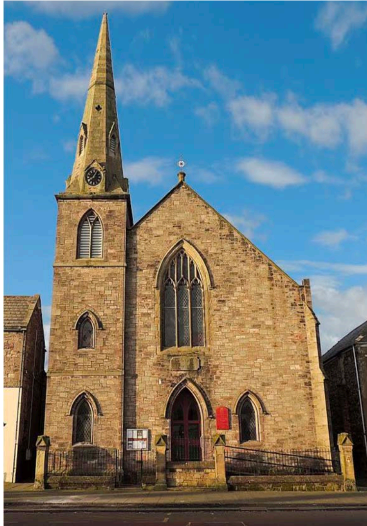
Spittal Community Centre