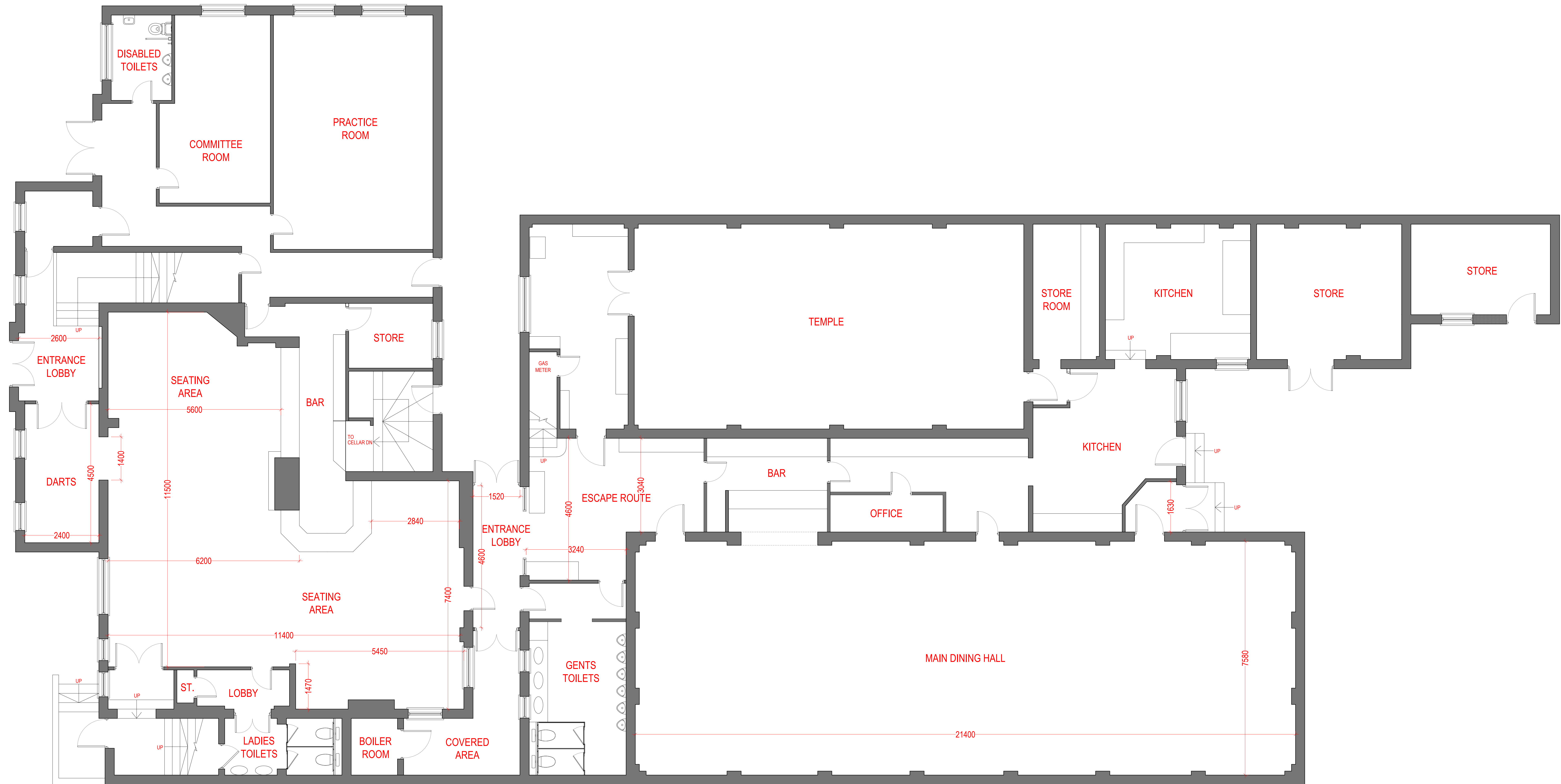
EXISTING GROUND FLOOR PLAN - SCALE 1:100